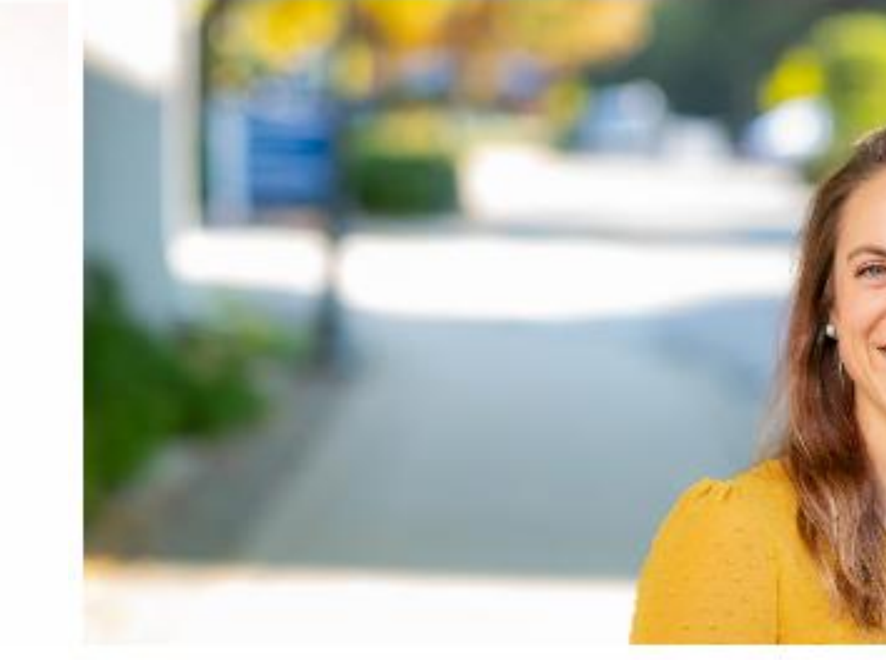
November 2, 2022